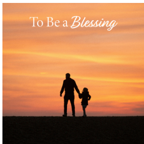
June 7 To Be a Blessing

Forming a Family/Preparing a People: The story of Abraham and Sarah is complex, full of twists and turns, great faith, and crippling fear. Through it all, it is a story about a family that struggles and learns to love in ways that could be an invitation to the whole world. It is a story about the people of God who want to follow, even when their wisdom falls short. It is a story about blessing, about receiving a blessing, and then being a blessing.