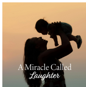
June 14 A Miracle Called Laughter

Genesis 12:1-9 Psalm 33:1-12 Romans 4:13-25 Matthew 9:9-13, 18-26