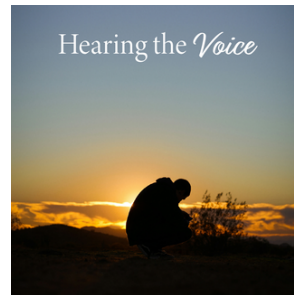
June 21 Hearing the Voice

Genesis 18:1-15, (21:1-7) Psalm 116:1-2, 12-19 Romans 5:1-8 Matthew 9:35-10:8, (9-23)