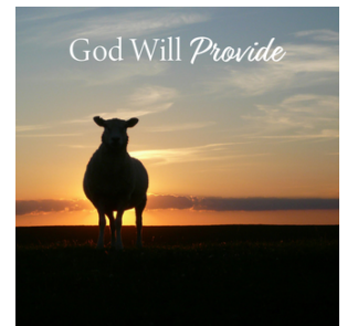
June 28 God Will Provide

Genesis 21:8-21 Psalm 86:1-10, 16-17 Romans 6:1b-11 Matthew 10:24-39