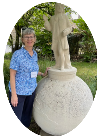
Epworth England "The World is my Parish", John Wesley